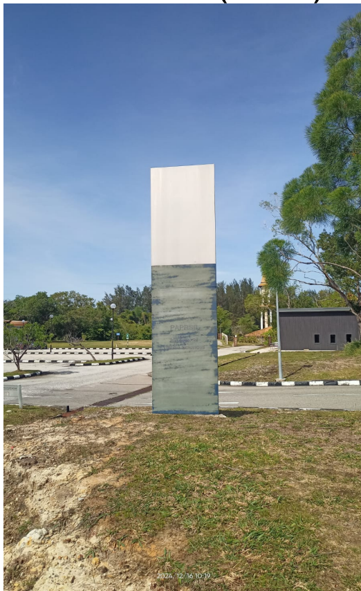
TYPE C (13 NOS)