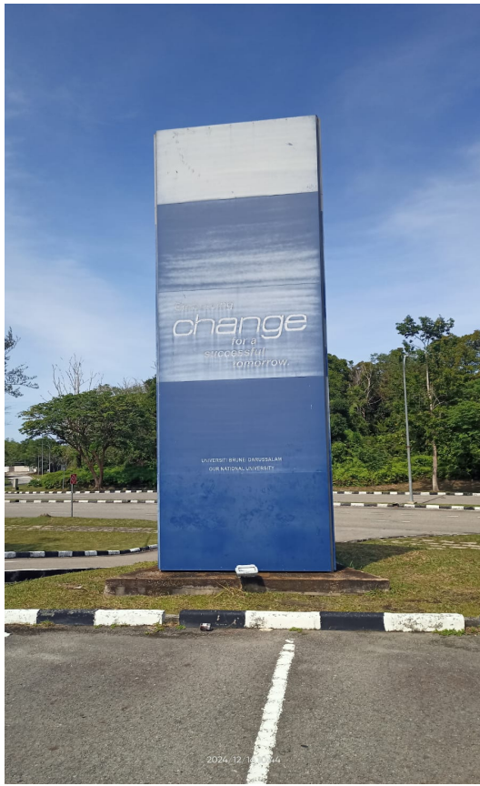
TYPE A (1NO)