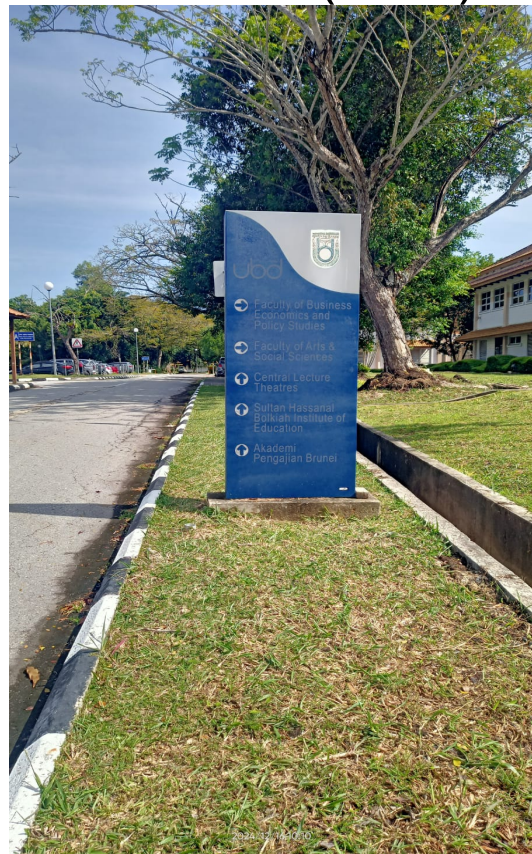
TYPE D (25 NOS)