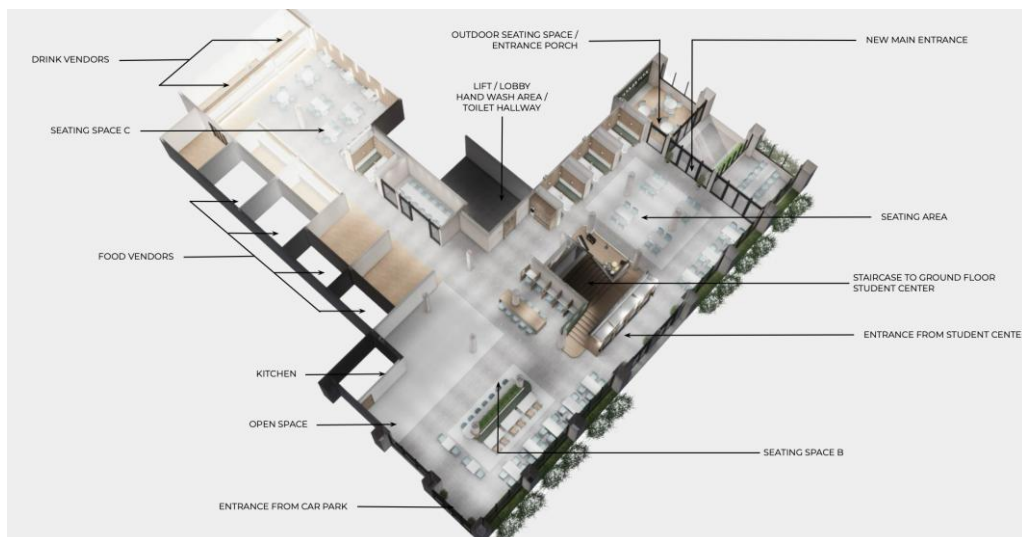
Layout 1: UBD Cafeteria Layout